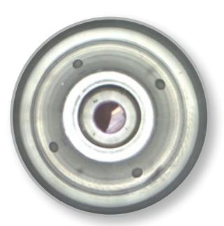
Checking for burrs