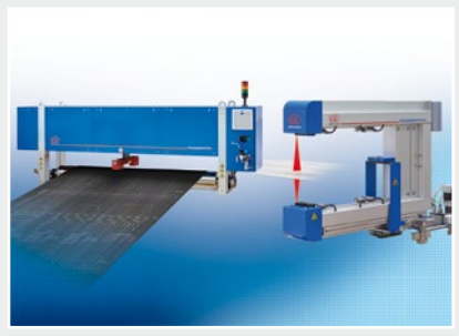
Measuring and inspection systems for metal strips, plastics and rubber