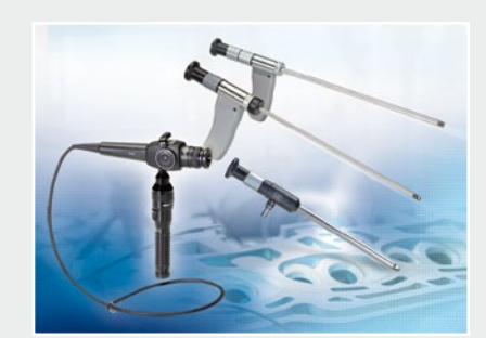
Industrial endoscopes, light sources