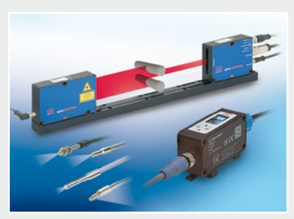
Optical micrometers and fiber optics, measuring and test amplifiers